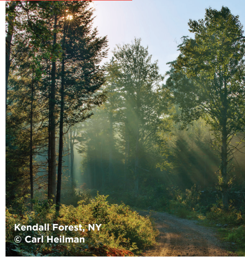
Kendall Forest, NY