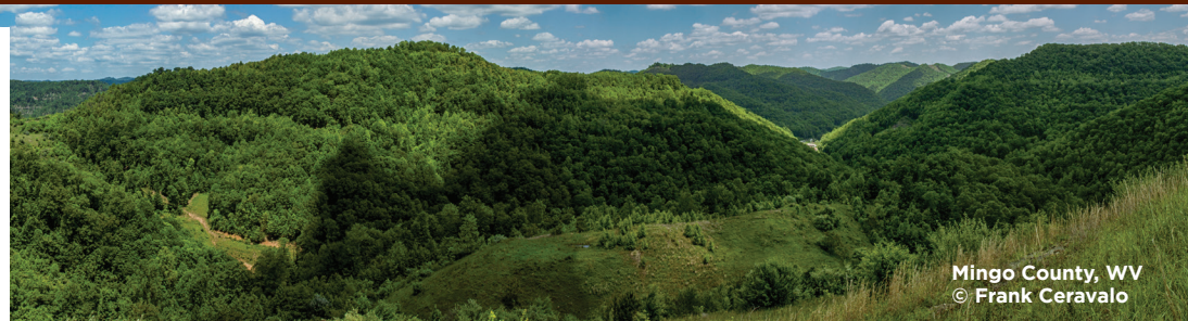
Mingo County, WV