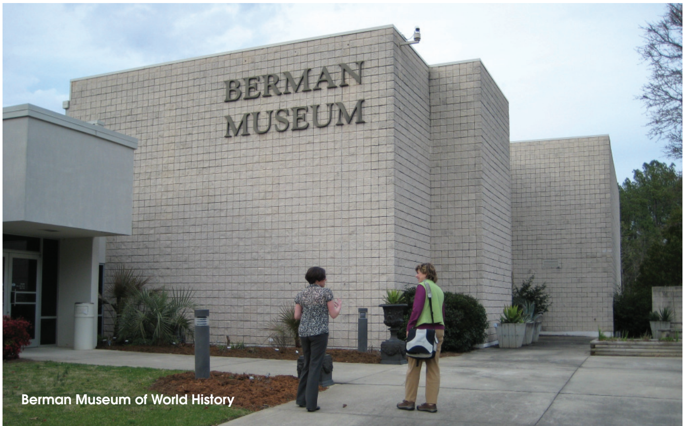
Berman Museum of World History