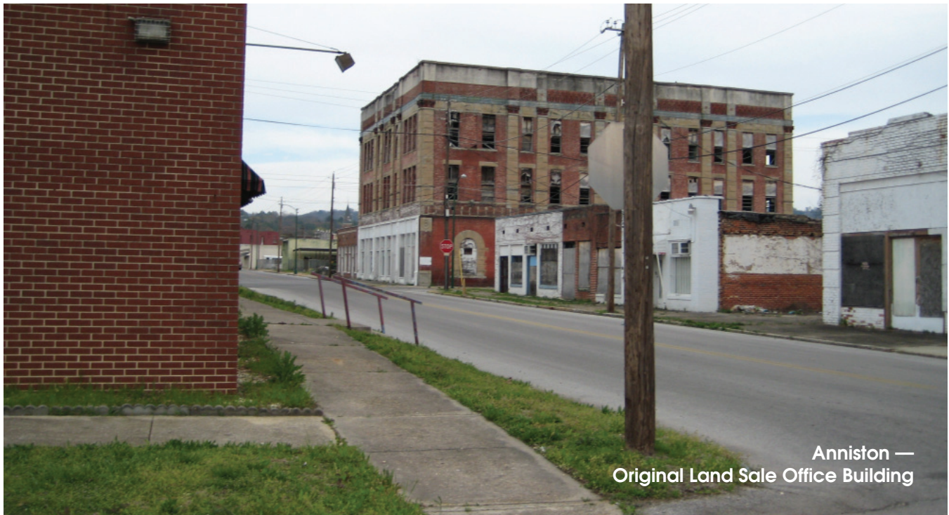
Anniston — Original Land Sale Office Building

boost as the views of vacant shopping centers, vast parking lots, and empty chain restaurants negatively affect the visitor experience. The Longleaf Lodge provides additional options but it seems geared to the business traveler more than the tourist. Lodging at Cheaha and campgrounds on state and federal lands provide other overnight accommodations.