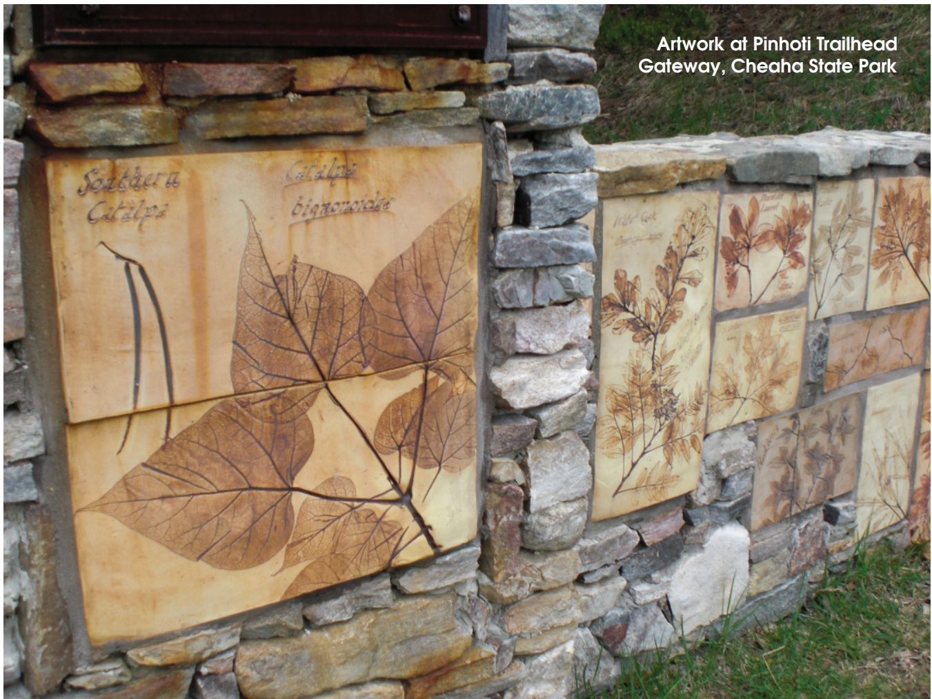
Artwork at Pinhoti Trailhead Gateway, Checha State Park