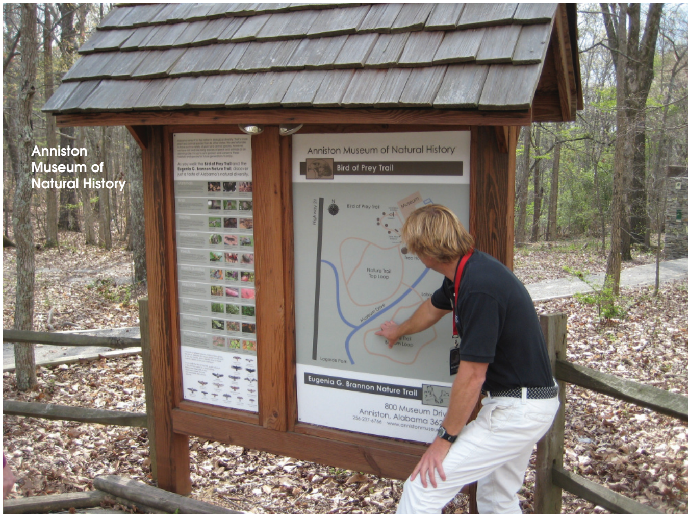
Anniston Museum of Natural History

resource compared to 31% who rely on friends and family. A 2004 U.S. Travel Association report shows that 64 million travelers use the Internet for travel planning with 44 million booking some or all of their trips online. Among the uses of the Internet for online travel planners are: maps/driving directions (70%), things to do (49%), local event calendars (35%), travel packages (35%) and places to go (34%).