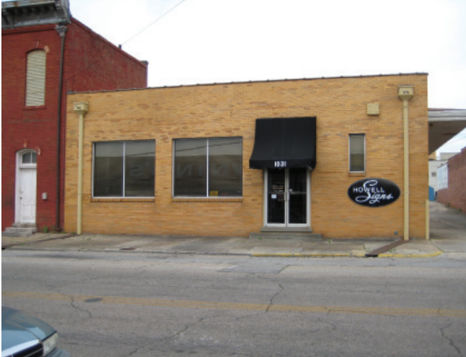
(below) Anniston – original bus station (right) Grace Episcopal Church