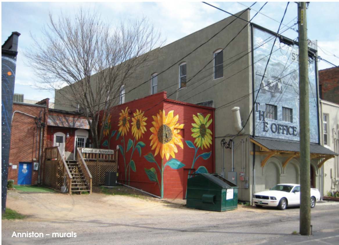
Anniston – murals

region’s artisans, musicians, and craftspeople, providing expanded opportunities for revenues and jobs. And they help tell the story of the place.