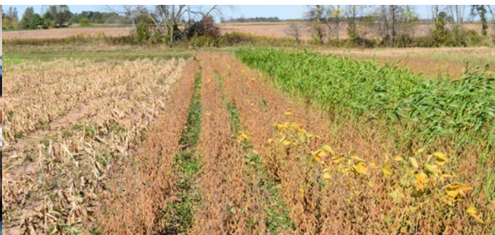
Demonstration farm plot: Cover crop interseeded into corn and soybeans, October 4, 2017.