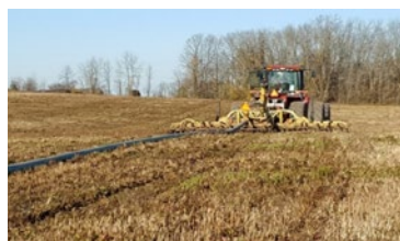
Low Disturbance Manure Application.