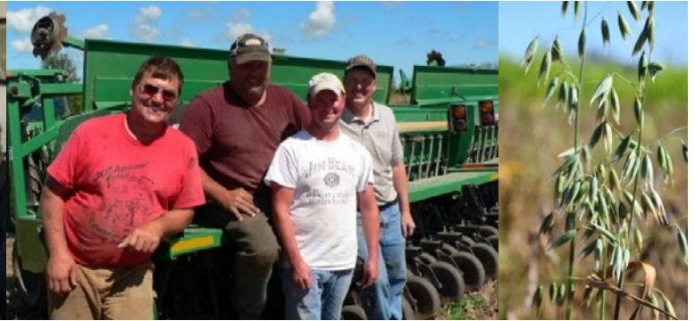
CFF Members Planting the 9-Acre Cover Crop Test Plot.