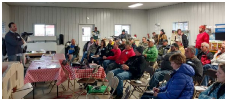
Milwaukee River Watershed Conservation Partnership Producer Kick-off Meeting, December 8, 2016.