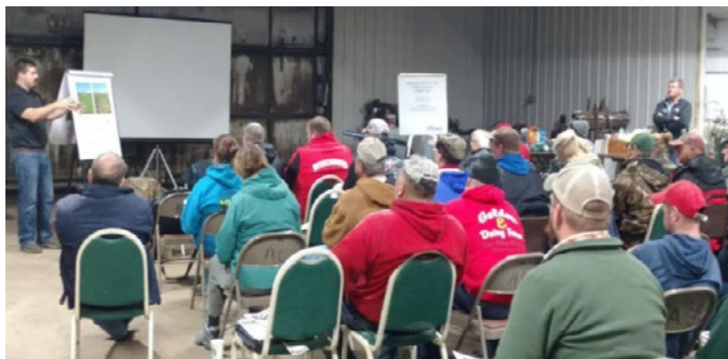
Clean Farm Families Producer led Watershed Group's first field day.

On October 26, 2016, the Clean Farm Families hosted field day was filled with conversation, soil health demonstrations, implement and machinery presentations, and farmer and partner networking. Farmers asked questions and shared their experiences with the varying soil types along Lake Michigan, crop rotations, cover crop seed mixes, fall planting methods and timing, and treatment in the spring all impact nutrients retained in the soil or coming off the fields. The field day provided the opportunity for over 60 farmers, conservationists, agribusiness partners, and community members to share and learn together.