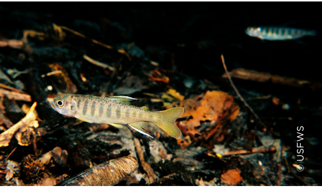
Salmon habitat restoration projects are a high priority for the Fund. The salmon populations increased in 2012 because of favorable ocean conditions and wet winters in 2010 and 2011.

habitat. This takes advantage of recent techniques using unanchored wood, which provides for a dynamic river system and reduces project cost and permit complexity. Upgrading our road infrastructure to avoid sediment delivery is our highest long-term priority and an absolute necessity, if we want to see the return of healthy fish populations. To date, we have improved 135 miles of roads, preventing the release of sediment equivalent to 13,678 dumptruck loads.