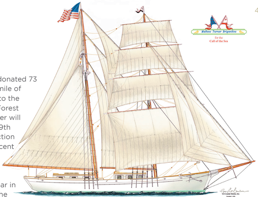
The Educational Tall Ship project is constructing a 124-foot brigantine that will provide hands-on education for kids and adults, during construction and after completion.

In 2012, The North Coast program donated 73 Douglas fir logs—more than half a mile of lumber—from our Big River Forest to the Educational Tall Ship project. This Forest Stewardship Council-certified lumber will be the principal wood used in the 19th century-inspired tall ship's construction and will make up more than 50 percent of the vessel's structure. The Educational Tall Ship will provide unique learning experiences to more than 10,000 students each year in the San Francisco Bay Area. Over the next 18 to 24 months, beginning when the keel is laid, the vessel will be built with help from Sausalito and Bay Area shipwrights, carpenters, marine technicians, volunteers and students. During the building process, the construction site will be open to students and the general public. Check out this link to find out what's happening with the ship's construction now: https://twitter.com/SFTallShip .