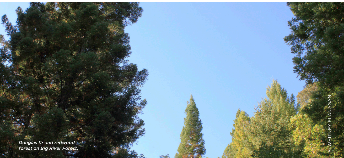
Douglas fir and redwood forest on Big River Forest.