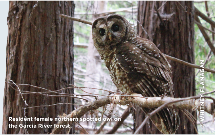
Resident female northern spotted owl on the Garcia River forest.