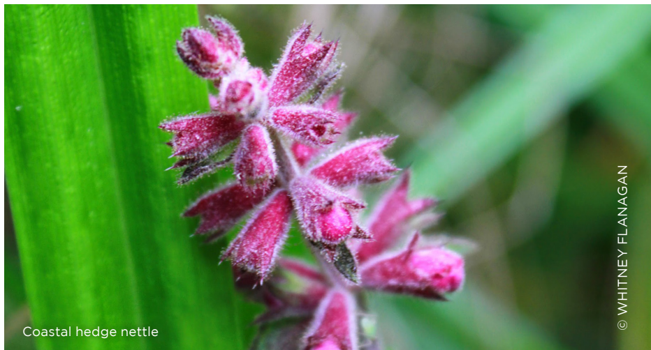
Coastal hedge nettle

The Fund completed the sale of the 95-acre "Walala Vineyard" parcel acquired as part of our 2013 purchase of the property formerly known as Preservation Ranch. The sale proceeds were used to repay a portion of a loan from the David and Lucile Packard Foundation that helped the Fund complete the purchase.