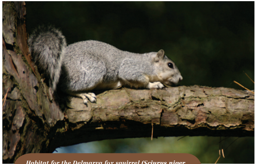
Habitat for the Delmarva fox squirrel (Sciurus niger cinereus), a federally listed endangered species, was found at Llandaff during the conservation assessment.

The second resource management challenge arose during the conservation assessment for the subdivision when it was discovered that the property contained habitat for the Delmarva fox squirrel, which is a federally listed endangered species. Larger and heavier than the Eastern gray squirrel ( Sciurus carolinensis ), the Delmarva fox squirrel is also slower moving and warier than it's cousin and is found principally on